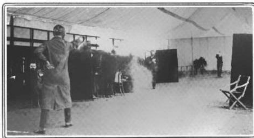
WAX FOR LEAD; BLOODLESS DUELLING AT THE OLYMPIC GAMES.

At the 1908 London Olympics, Duelling was an exhibition non-medal shoot, and 11 competitors from America, France, Russia and Sweden shot at each other at a distance of 60ft, with wax bullets. They wore heavy canvas clothing, metal masks with goggles and the pistols were modified with a hand guard.